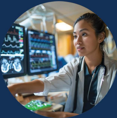
ER and ICU