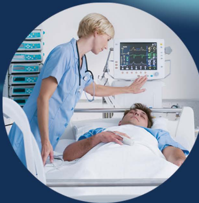
Acute and Post-Acute