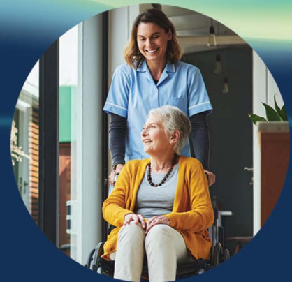
Outpatient and Home